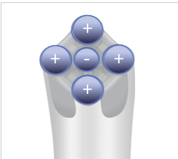
TOUCH MASSAGING PROBES