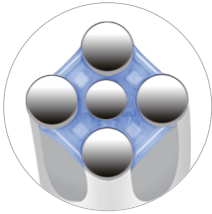
Blue Light Mode