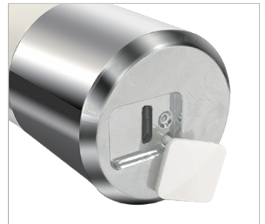
USB CHARGING PLUG