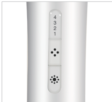
CONTROL PANEL BUTTON