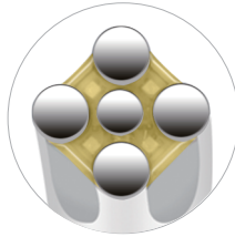
Yellow Light Mode